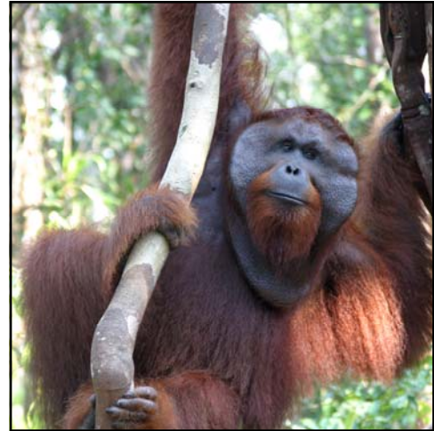
Adult male orangutan

Primarily frugivorous, orangutans have an important role as seed dispersers. They selectively choose ripe fruit whose seeds are adapted to withstand passage through the orangutans' gut. Once excreted, the seeds find themselves in their own little compost pile, which helps them to become established. Over 400 food types have been documented as part of the orangutans' diet, and although it consists mainly of fruit, in times of scarcity orangutans will shift their eating habits to lower quality food, such as bark, leaves & termites, rather than travel to a different area. As well as acting as seed dispersers, orangutans help to open up the forest canopy. This allows light to reach the forest floor, which helps the forest regenerate naturally. They are a vital cog in the workings of the rainforest ecosystem.