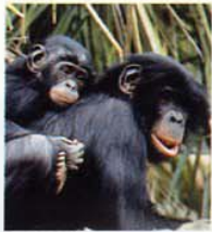
BONOBOS Critically endangered and suffering from war and civil unrest.