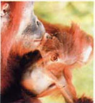
ORANGUTANS Extinct by 2010 if their habitat continues to disappear at current rate.