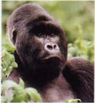
GORILLAS Threatened by poaching, deforestation, human disease and war.