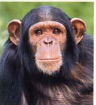
CHIMPANZEES Threatened by the bushmeat trade and habitat loss.